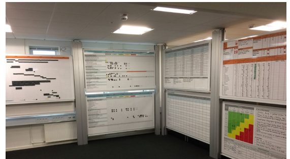
Collaboration room for O+G megaproject 5 billion USD